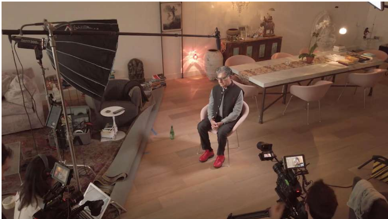
Interview with Deepak Chopra.