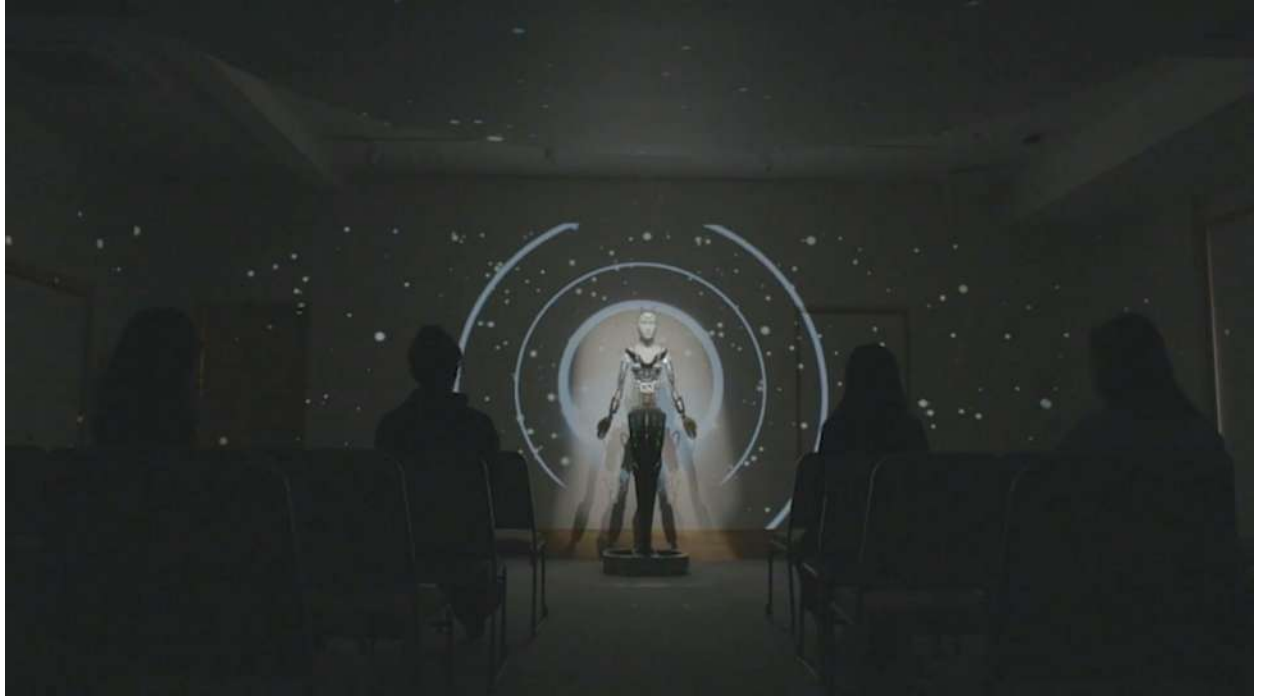
Robot Buddhist priest, Mindar, at the Kodaiji Temple in Japan.