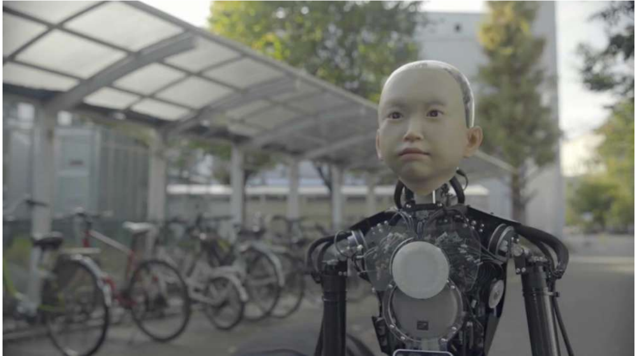
The child robot, Ibuki, takes a walk at Osaka University.